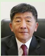
Hon. Shih-Chung Chen, DDS Minister Taiwan Ministry of Health and Welfare